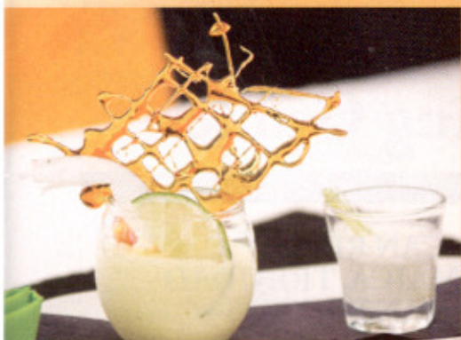
1st Place Dessert – Caro Uy, Toucan Play