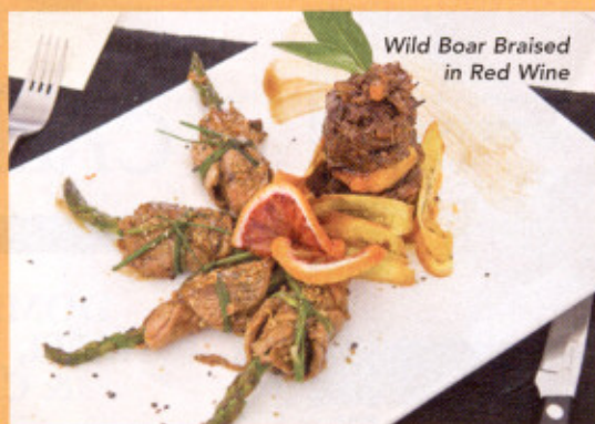
Winning Entrée Dish – Caro Uy, Toucan Play