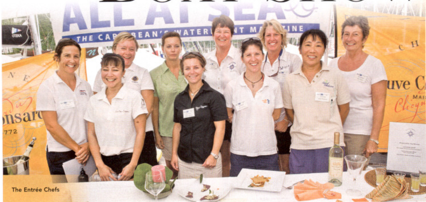
The Entrée Chefs