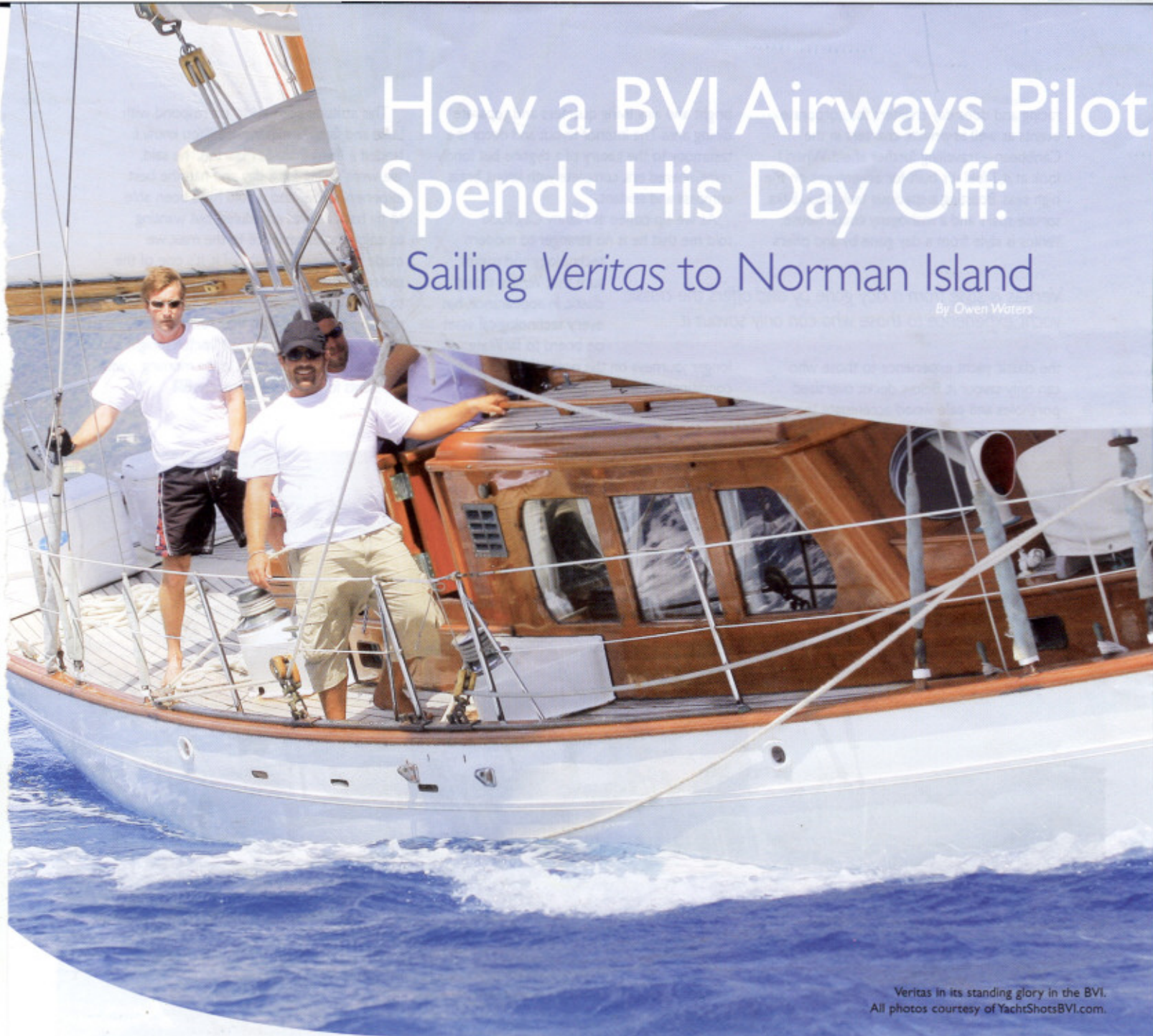
Veritas in its standing glory in the BVI.