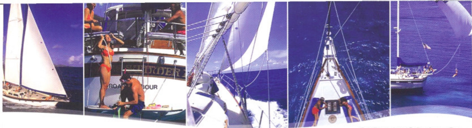
Good Time onboard Endless Summer Two